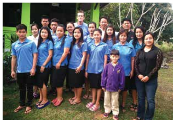
Staff and students from the bible training center.

Over the past few weeks, we have been putting a wall around a portion of our land. The property is about 2 acres and was purchased to put a training center and a children's home on the land. We are now ready to begin the process with the children's home. Over the last few decades, the children of Burma have been raised in very difficult and desperate, unsafe conditions. We have purchased the property near a major city where the children (especially from the villages) will be able to receive a proper education, but more than that they will have a godly home where they will receive continual instruction in the Word of God. We are going to give these children a quality