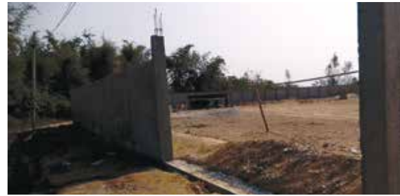
Recently finished wall around the property.