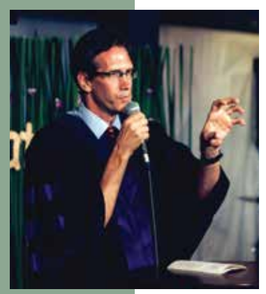
Preaching at graduation.

Philippines, which is in Metro Manila. It didn't take me too long to realize that I would be busy in Fairview. Aside from ministering in the school, I preached seven different times in his church! But it was fun as the members of his church and the Bible school students are so hungry to receive the Word of God.