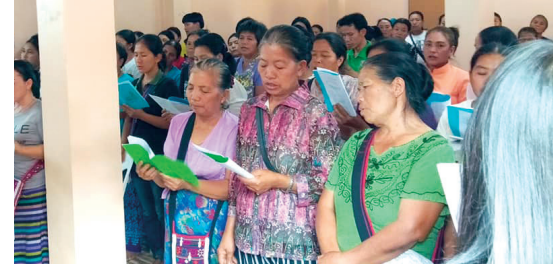
Our first women’s conference.