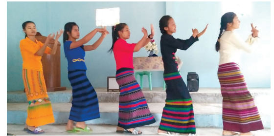
Bible students performing traditional dance.

Because of the dry season was long this year, our current well went dry. Looks like we will have to deepen the well and also harvest more water from the upcoming rainy season. We are believing God for a bigger and newer vehicle this year to transport the children to and from school, we still need about $8000 plus for this vehicle.