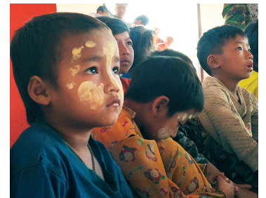
Children in our village outreach.

teachers for many of these remote areas. We have decided to take in a couple of the children this year as they will be old enough for school.