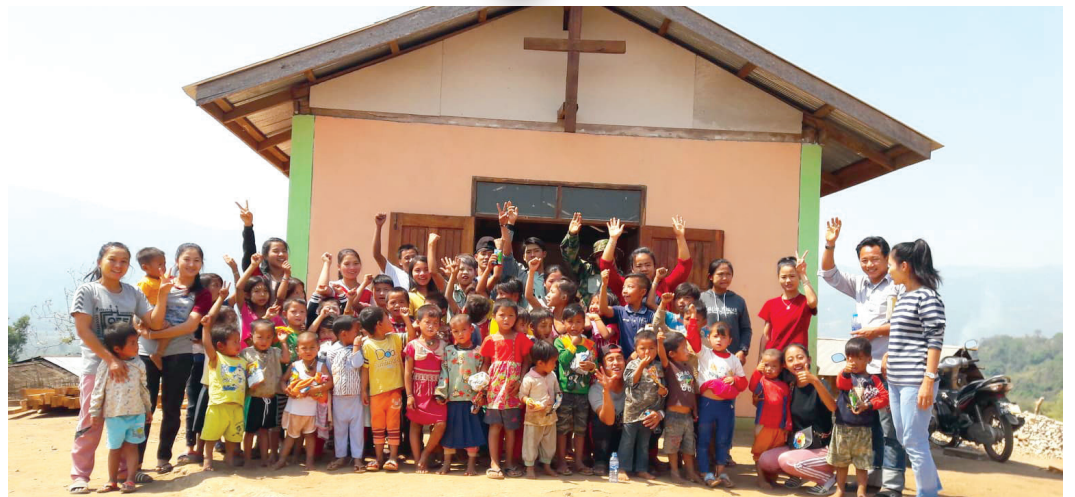
Outreach Bible students.

Design and printing donated by Image Printing, Inc.