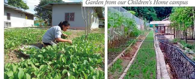
Garden from our Children's Home campus