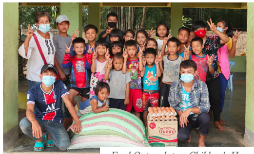
Food Outreach to a Children's Home

Design and printing donated by Image Printing, Inc. USA imageprinting.com