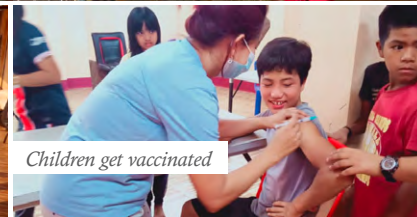
Children get vaccinated