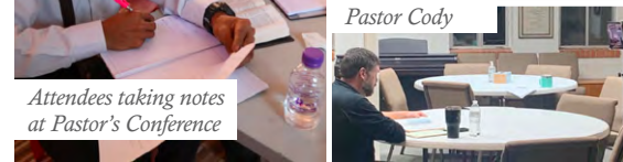
Attendees taking notes at Pastor's Conference