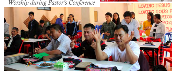
LOVING JESUS LOVING GOD'S PEOPLE PRIOR TO PROMISES PLUS