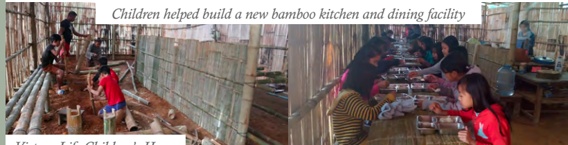
Children helped build a new bamboo kitchen and dining facility