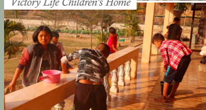
Victory Life Children's Home