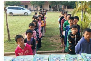
Handing Out Books to Children