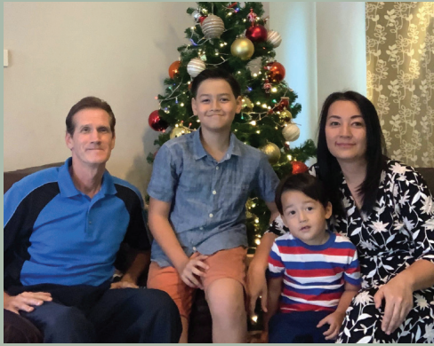
Family Christmas Photo