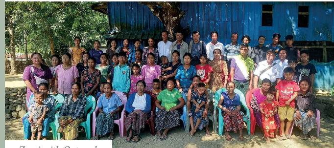
Zami with Outreach

PRSR STD US POSTAGE PAID BISMARCK, ND IMAGE PRINTING