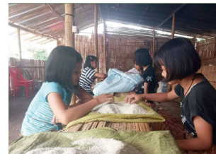
Children and Rice Harvest