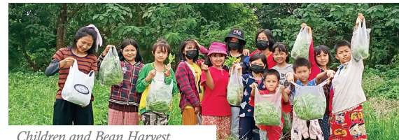
Children and Bean Harvest