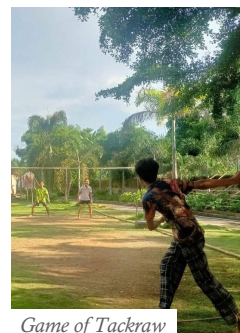
Game of Tackraw