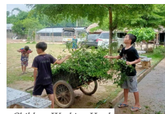
Children Working Hard