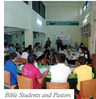
Bible Students and Pastors

BUILDING: Our additional living quarters is finished and we are so grateful for the finances and the labor that was put into this building. Maybe the greatest asset about this building is that the Bible students and some of the older children learned about putting up a building. The foreman and contractor were a couple of the pastors that we work with. We are grateful for their work.